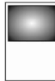
Half Page (horizontal) 7-1/2"w x 4-7/8"h