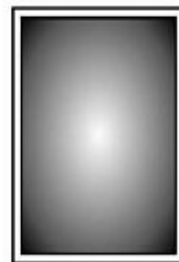
Full Page 7-1/2"w x 10"h