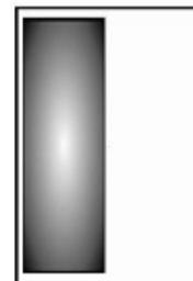
Half Page (vertical) 3-5/8"w x 10"h